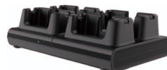
Battery Charging Base-4 slots