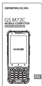
Quick User Guide