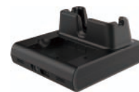
Battery Charging Base